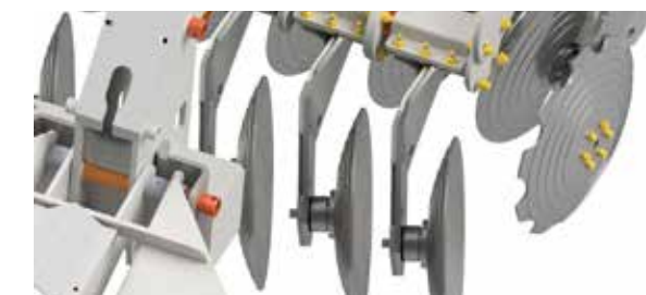
Cross-angled discs ensure every inch of your field is worked.