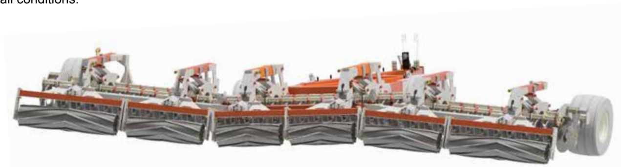
Effectively follow the contours of your field